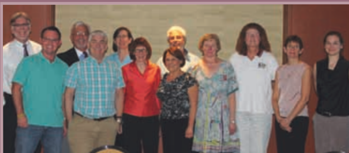
The AAEP's 2013 Board of Directors assemble for an in-person Board meeting in Dallas